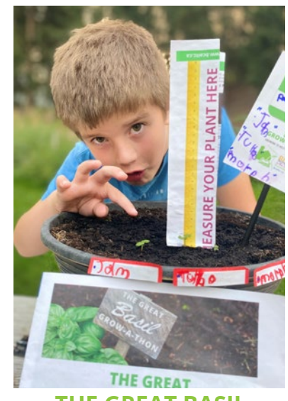
THE GREAT BASIL GROW-A-THON