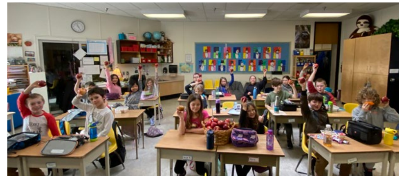
THE GREAT BIG CRUNCH