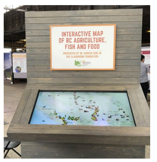
PACIFIC NATIONAL EXHIBITION