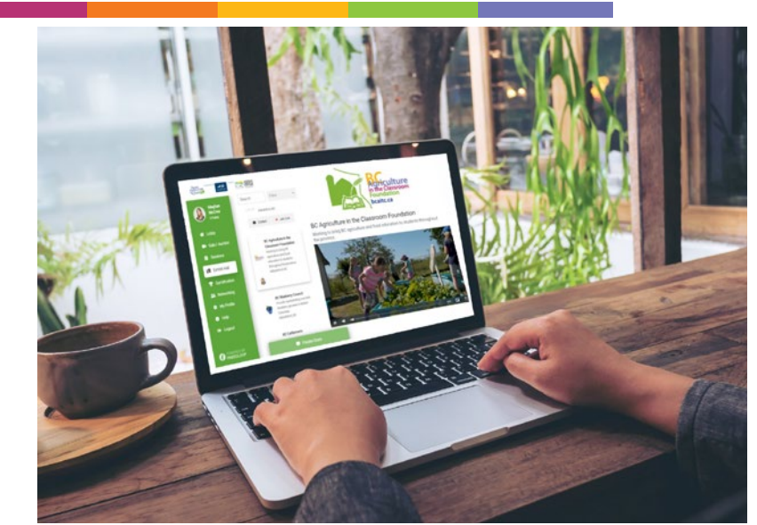
PACIFIC AGRICULTURE SHOW (VIRTUAL EDITION) & BC AGRI-FOOD GALA ONLINE AUCTION