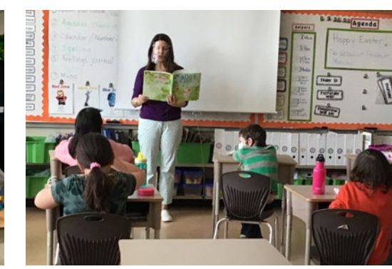
CANADIAN AGRICULTURE LITERACY MONTH