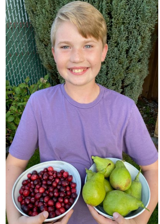
FIELD TO FORK CHALLENGE