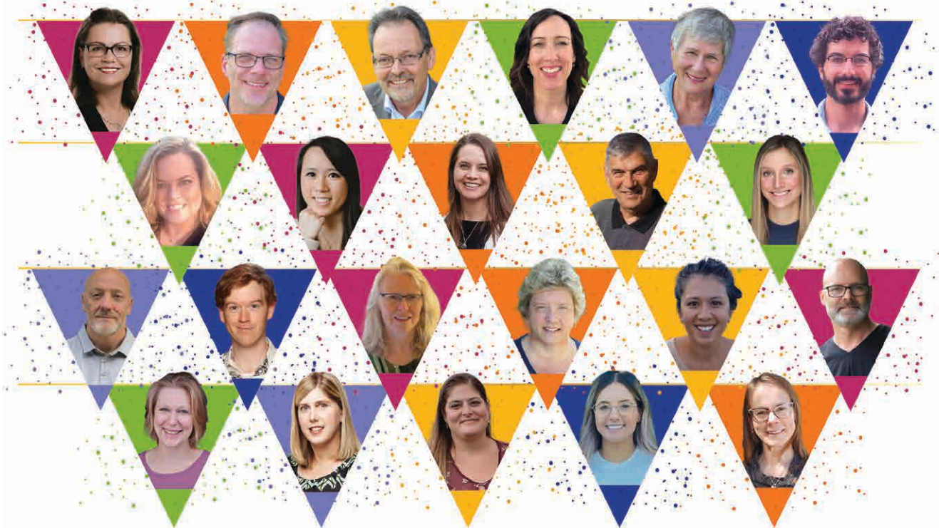
Pictured from left to right above, in order listed below