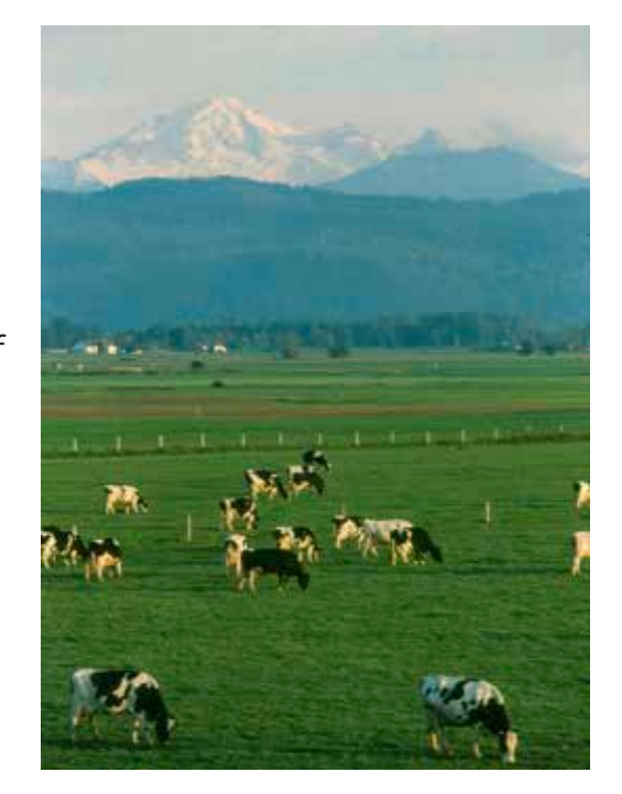
dairy cows grazing

There are several factors that contribute to the significance of agriculture in this region. Mild climate, availability of irrigation water, a diversity of crops, close proximity to markets with large and increasing populations, the ethnic diversity of local populations, and access to export markets (e.g., the US and Asia) all contribute to stable markets and the development of significant niche markets. Well-developed transportation systems also enable rapid and lower cost transport of commodities.